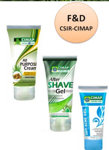
New Herbal Products of CSIR-CIMAP